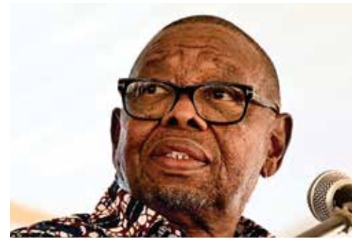
Minister of Higher Education, Science and Innovation, Prof Blade Nzimande, addressing the people during the unveiling of the skills centre.