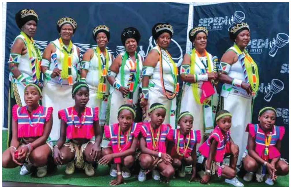
Ipopeng Cultural Group will be taking part in the upcoming Yilan International Children's Folklore and Folkgame Festival to be held in Taiwan next month.