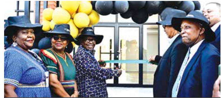
Minister of Higher Education, Science and Innovation, Prof Blade Nzimande (In front wearing black hat), cutting the ribbon to officially launch the Sekhukhune Skills Development Centre at Sekhukhune TVET College in Aquaville outside Groblersdal.

Nzimande explained how this will ensure sustainability and provide income for struggling homes. "Now traders can protect their goods in these stalls and have dignity when selling. I urge all young people to go and vote to defend the good things that have happened since 30 years of democracy," concluded Blade Nzimande.